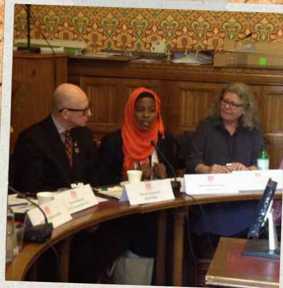
UMMU, A DISABILITY ACTIVIST FROM TANZANIA, MEETING KEY STAKEHOLDERS AT A ROUNDTABLE EVENT AT THE HOUSE OF LORDS.